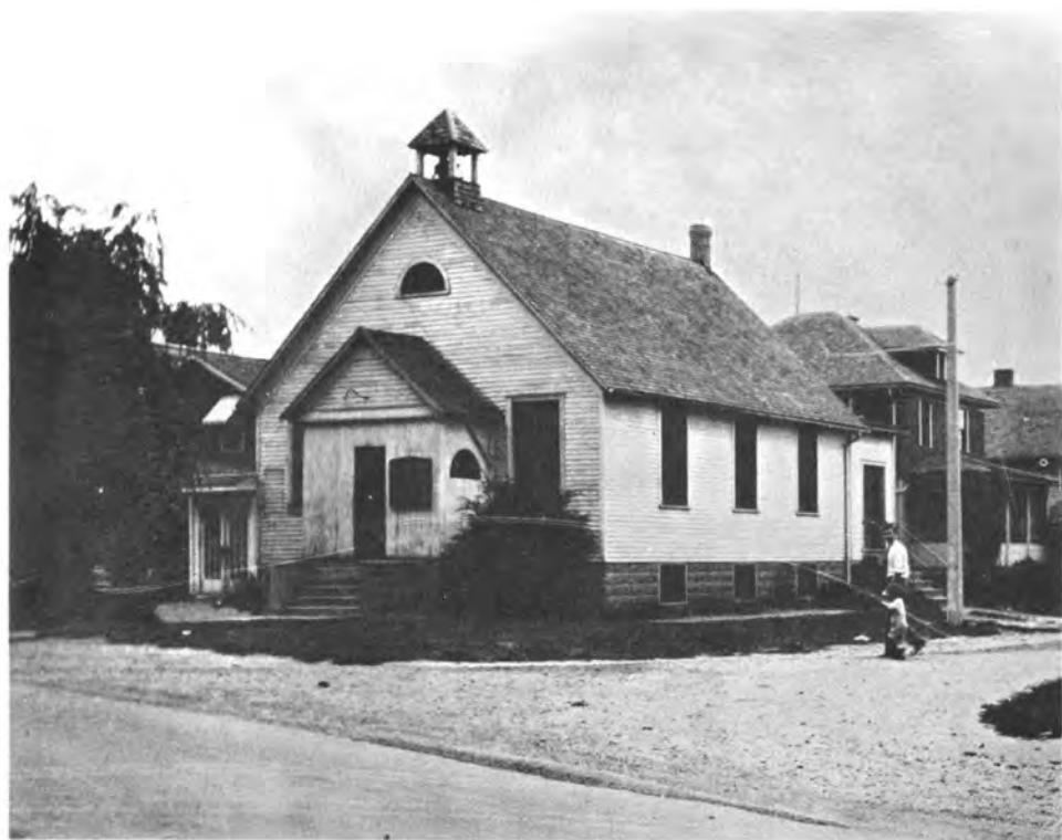
Who-So-Ever Will Chapel

Remember the days of old. Consider the years of many generations: ask thy Father and he will show thee; thy elders, and they will tell thee.