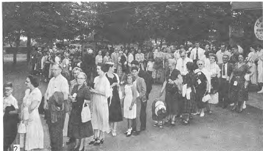
1. Four bus loads, which left after the Store closed July 9th, arrive at the Willow Point picnic grounds.