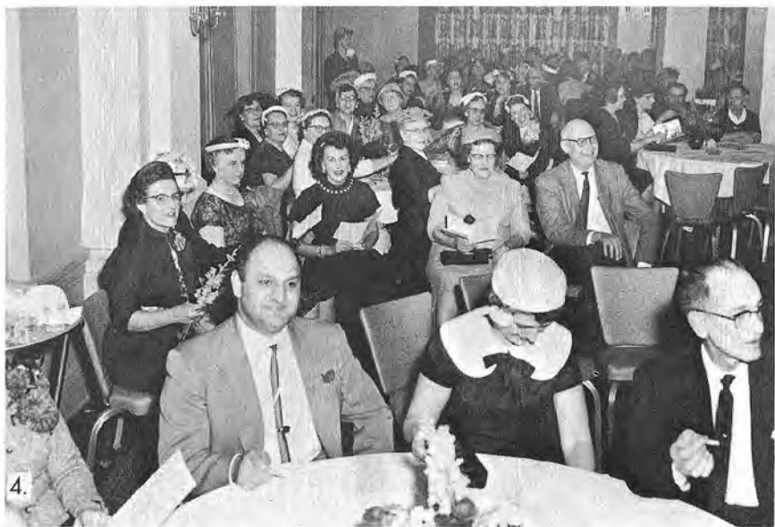
3. A shot of the annual Profit-Sharing dinner guests, with the speakers' table in the background.