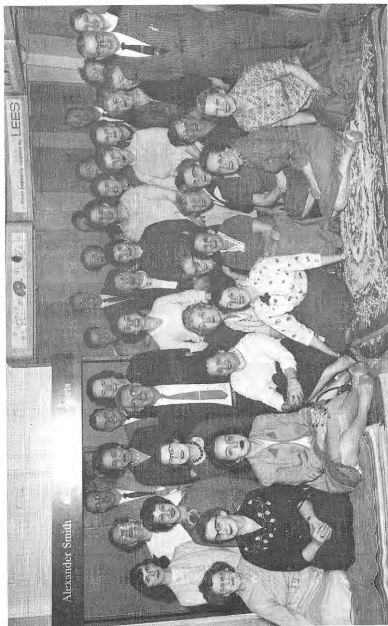
McCurdy's of Geneva Employees at their annual E.M.B.A. meeting the evening of February 25th. For

news of the election, and more pictures of the party, see the facing page.