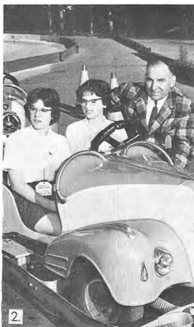
1. One of several lines waiting to be served. They moved quickly.