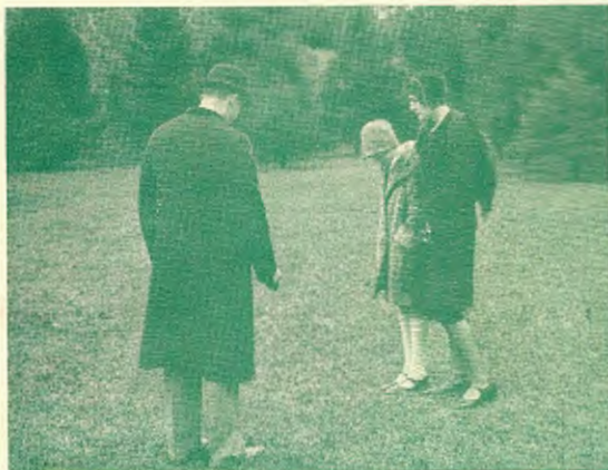
In this Case the Burden was Shifted to Weaker Shoulders.