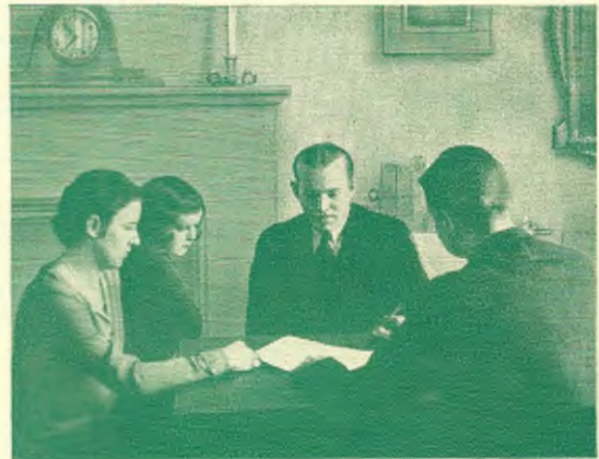
This Man Gives His Family the Protection of "Before Need" Purchase.

White Haven offers each family the opportunity of selecting and purchasing, at a surprisingly low price and on generous terms, a little spot in God's Acre. On completion of the payments a deed to the lot is delivered, and should be laid away with the family's insurance papers where it rightfully belongs. It may be many years before it is needed, but it might be next week. No one in the hour of need ever regretted a previous provision for the event but many have in great sorrow regretted that such a provision had not been made.