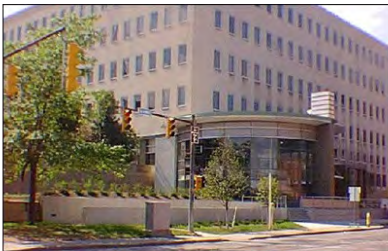
Entrance to Monroe County Civic Center

The court that settles an estate after a person has died is called Surrogate Court in New York State. This court is called Probate Court in most other states. In Monroe County, the Surrogate Court records are available from the Surrogate Court office in room 541 on the fifth floor of the Hall of Justice in the County Civic Center (99 Exchange Blvd., Rochester, NY 14614). All index volumes and file packets have been moved to a private storage company. They have been replaced with many computer terminals. On the computers are indexes to all the records from 1821 to present. Also about 75% of the court files are also available to be viewed on the computers. You can email or download the entire file (as a PDF file) for a decedent to a USB flash drive. Sending the records via email may cause a problem with your email account as some of the files are very large. If there is a court file that is not yet on the computer, you can fill out a form and the office will have it scanned and make it available in a week or so.