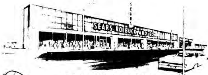
SEARS RIDGE ROAD