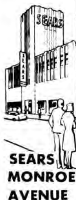
SEARS MONROE AVENUE