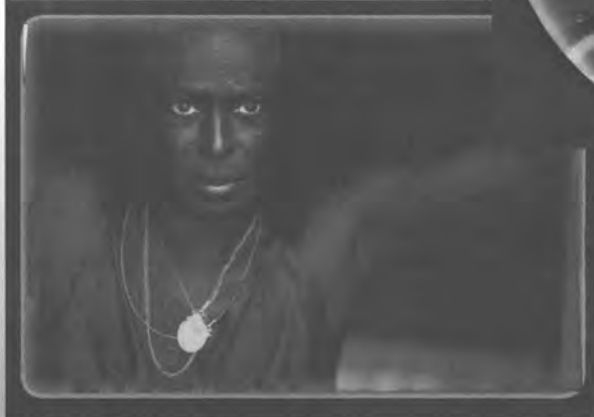
Newport Jazz Festival, 1990.