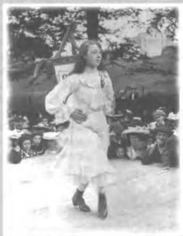
A display of Irish step dancing, County Antrim, 1900.

In the last quarter of the 19 th century, The Gaelic Revival was an attempt on the part of the writers and intellectuals of the day to promote an awareness of native Irish culture, mythology and language, much of which had been erased by centuries of English rule. The theory was that a people could not create a nation without a sense of national identity; that the first step towards independence could be the celebration of a heritage and a creation of a new body of literature that would ennoble the Irish people and inspire them to desire wholeness as a nation. To this end, The Gaelic League strove to revive the use of the