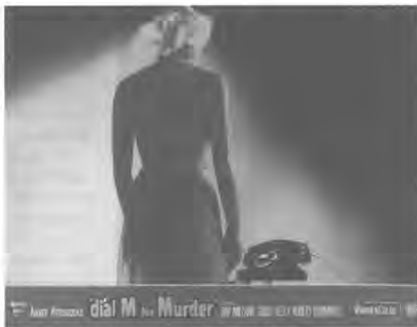
The promotional lobby card for the American film release.

— excerpted from an article in London's The Independent