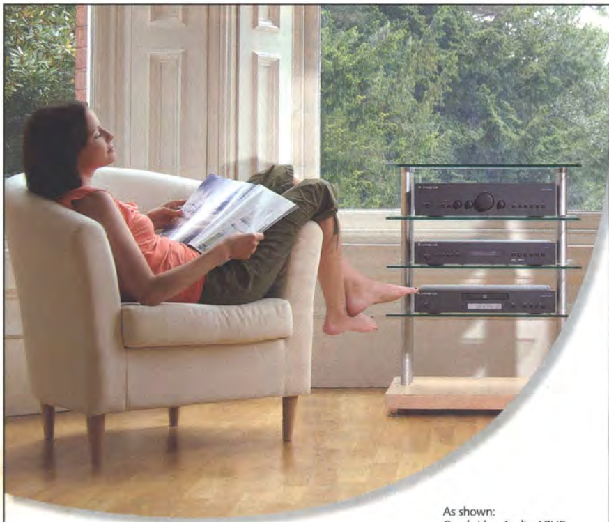
As shown: Cambridge Audio AZUR 340A Integrated Amplifier 340T Tuner 340C CD Player

HDTVs Home Theater Multi-room Audio Single Remote Control System