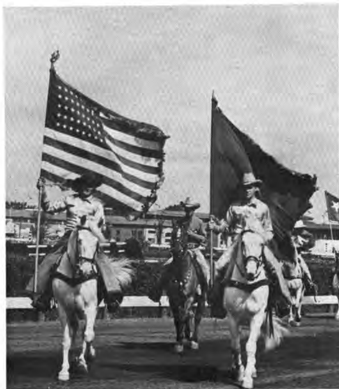
THE GRAND ENTRY