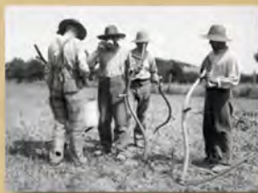
Penitentiary inmates tend the fields, ca. 1909.

The penitentiary remained open until 1971, when the county transferred the last remaining inmates to the new Monroe County Jail on Plymouth Avenue downtown.