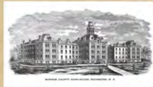
The Monroe County Almshouse. After an 1872 fire, this larger building was erected to accommodate 400 “Inmates.”

The original almshouse was replaced in 1933 by a newly constructed Monroe Community Home and Infirmary, known today as Monroe Community Hospital, at the corner of Westfall and East Henrietta Roads.