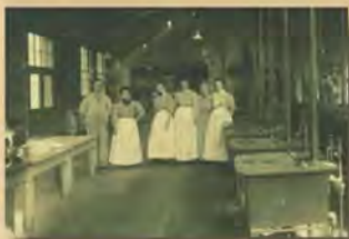
Kitchen staff at Rochester State Hospital, ca. 1909.

The Monroe County Insane Asylum opened in 1857. Before that, the indigent “insane” were held at the almshouse.