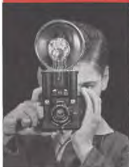
Holding camera for a horizontal picture.