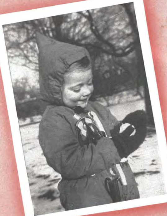
Actual size of pictures made with the Brownie Flash Six-20 (2¼ x 3¼ inches).