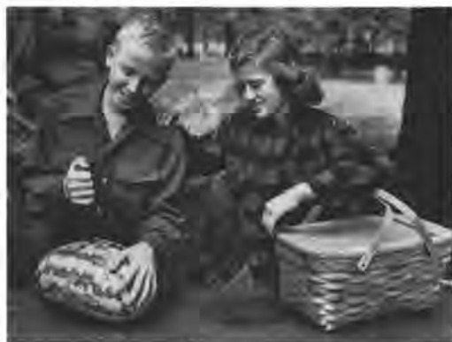
You can get some fine expressions on young and old folks when they're engaged in getting the food ready at a picnic. Keep your camera handy for such unposed shots

M AKE your friends look natural and appealing in snapshots. You can do this by picturing them while absorbed in their work or in a hobby.