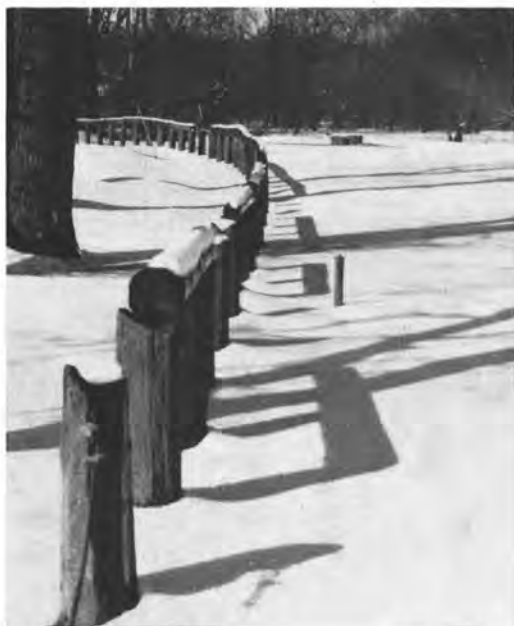
"Shadows on Snow"

Here are three of the pictures which won awards in the black-and-white print section of the salon held by Kodak Heights Camera Club recently. The first-prize winner appears on the inside front cover of this issue