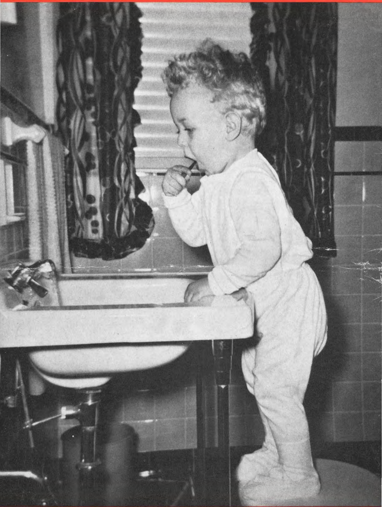
Boy and Brush