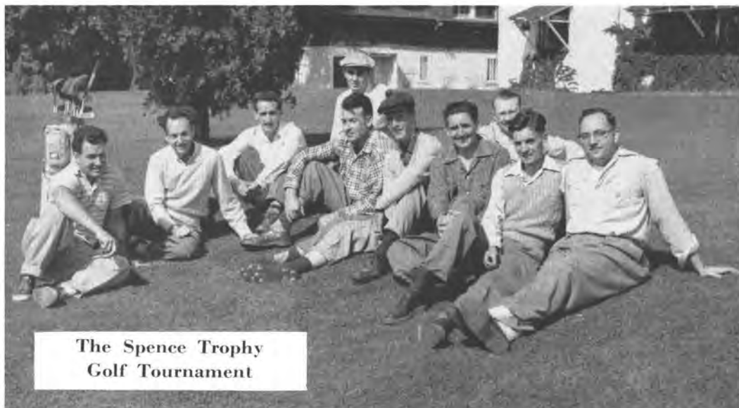
Some of the 75 golfers who took part in the tournament relax on the clubhouse lawn while waiting for the dinner hour