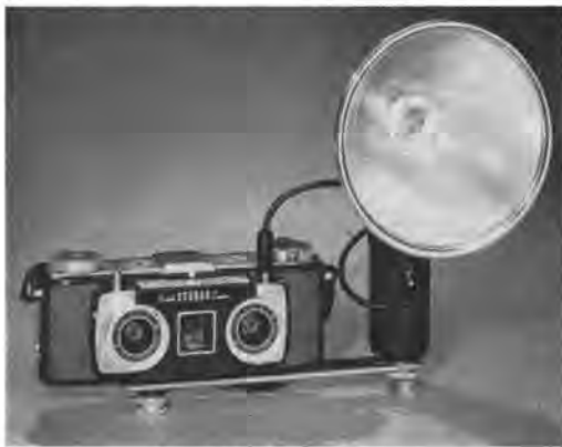
The Kodak Stereo Camera

V ISITORS to Kodak Heights during the George Eastman Centennial showed much interest in the new Kodak Stereo Camera