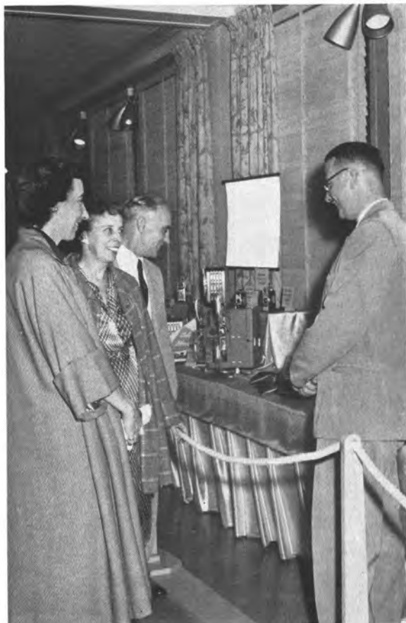
Displays were staffed by Kodak technical representatives

Story and more pictures appear on following pages