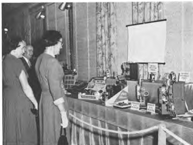
Displays gave comprehensive view of past and present Kodak products