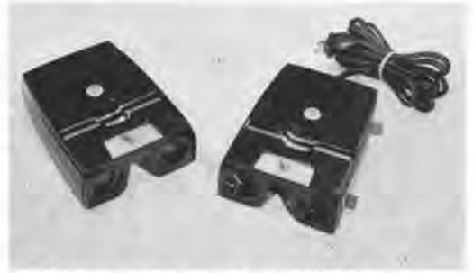
The Kodaslide Stereo Viewers, Models I and II

A unique feature of the new camera is a built-in exposure calculator.