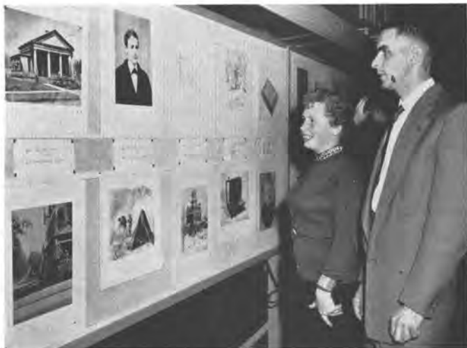
The many pictures of Mr. Eastman received close attention