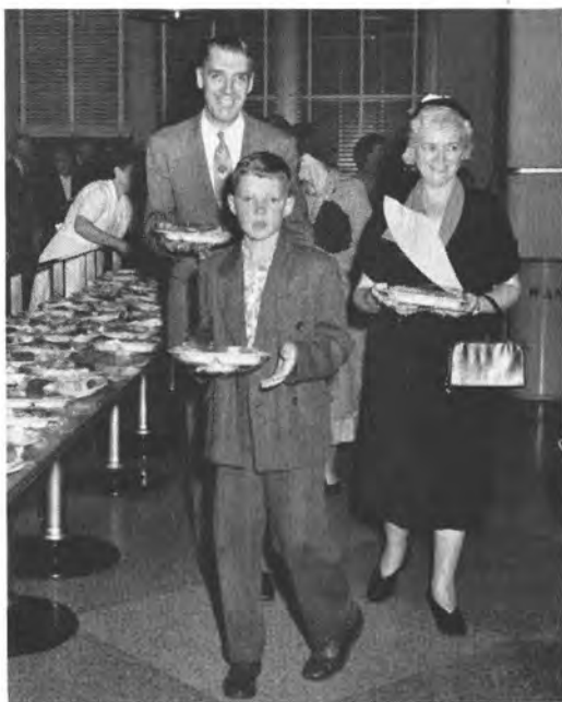
Refreshments followed each evening's program