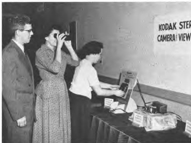
The Kodak Stereo Camera and Viewers attracted much interest