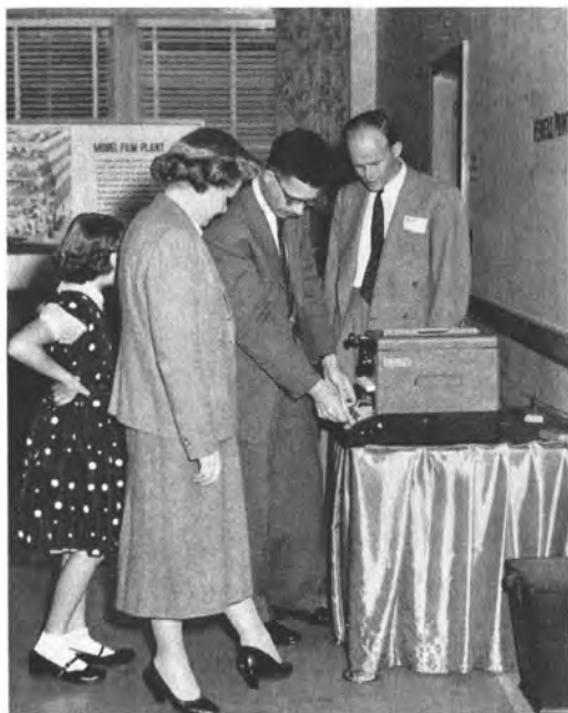
Another popular display was the Verifax Printer