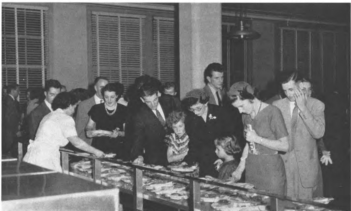
The arrangement of sandwich plates on long tables provided quick service when the guests entered the cafeteria