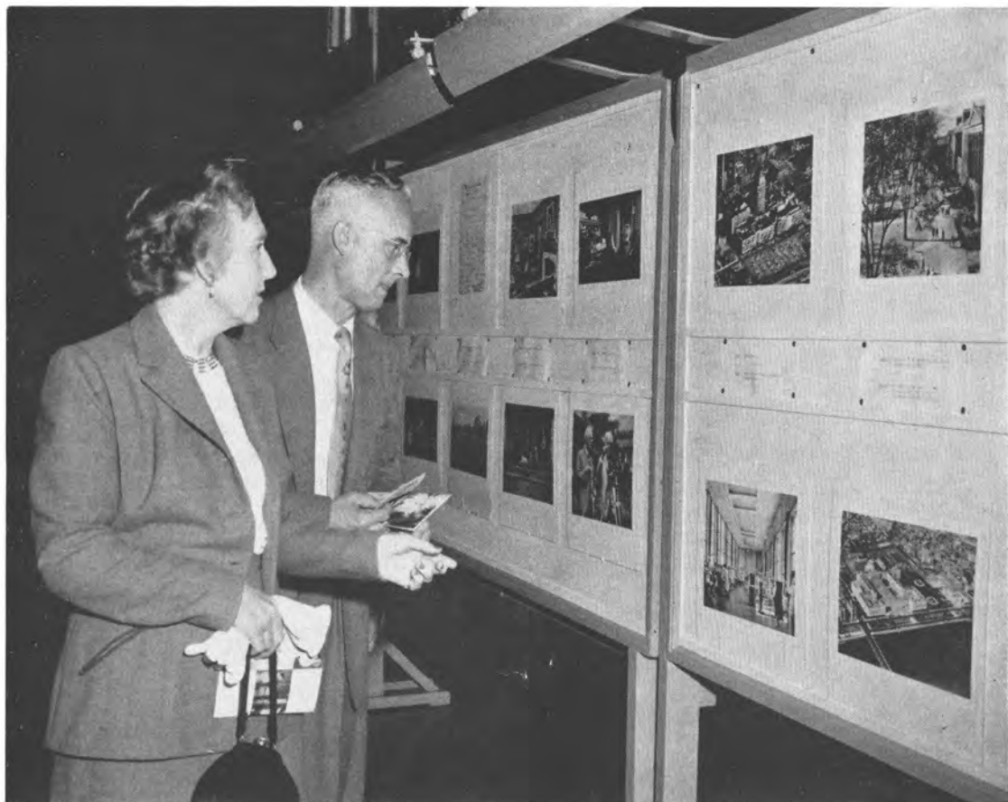
The many easels of mounted prints placed across the back of the auditorium were carefully viewed