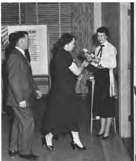
Guests received souvenir copies of new book "Kodak in Canada"

"Kodak in Canada" may obtain one through the editor of Kodak Magazine.