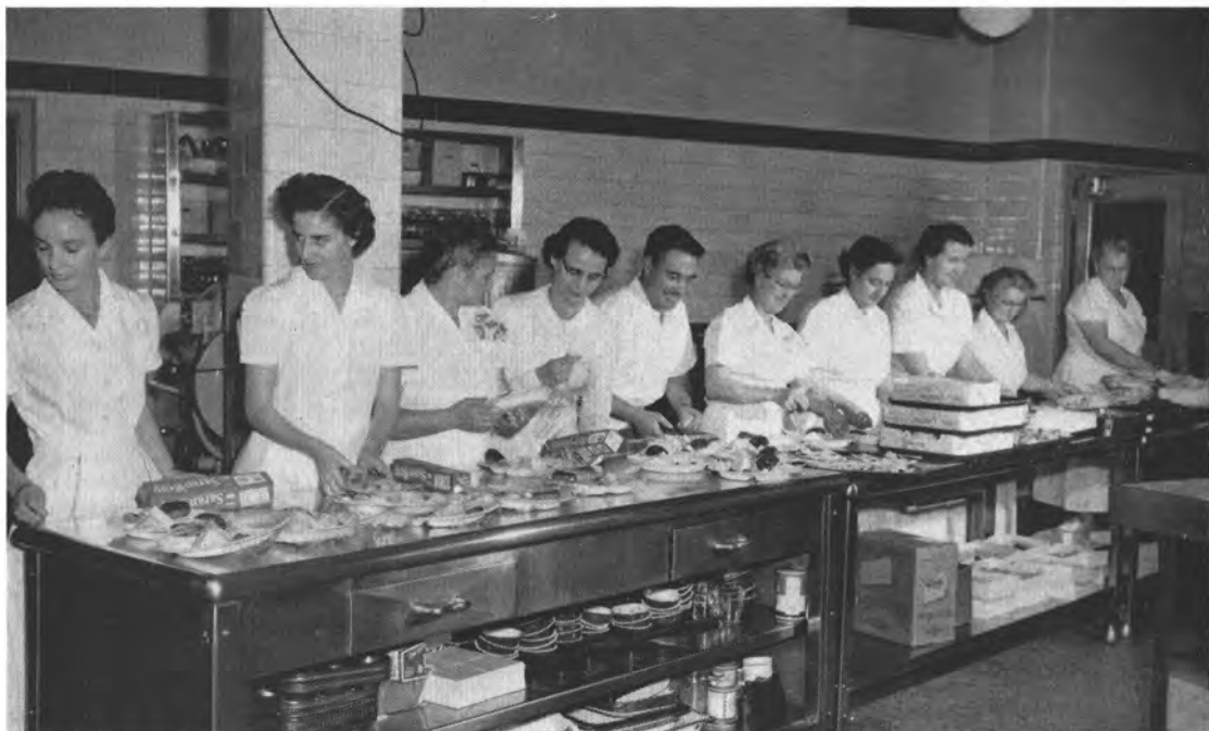
Refreshments were prepared in the kitchen of the Recreation Building with an efficient production line system