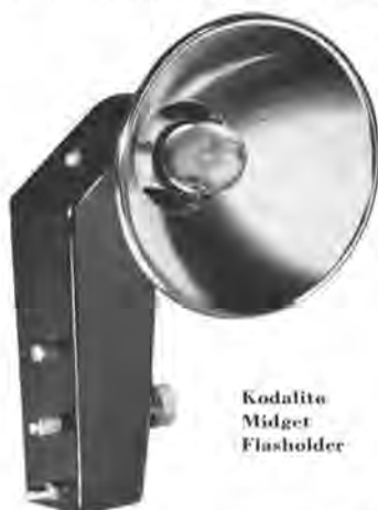
Kodalite Midget Flashholder

T HE Kodalite Midget Flashholder, which has been a popular feature of the Brownie Bull's-Eye Flash Outfit and available separately in brown color, as an accessory for the Brownie Holiday Flash Camera, is