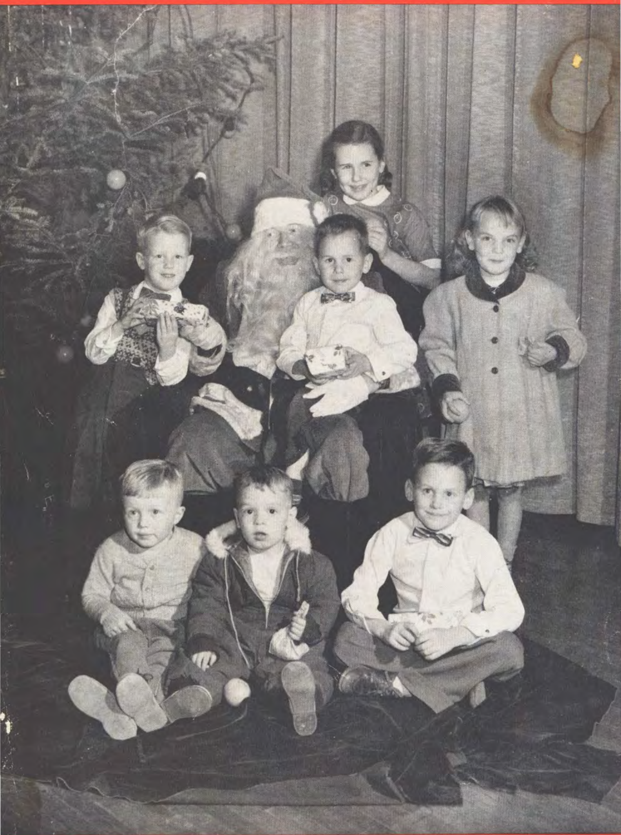
Santa with some of his young friends at Kodak Heights