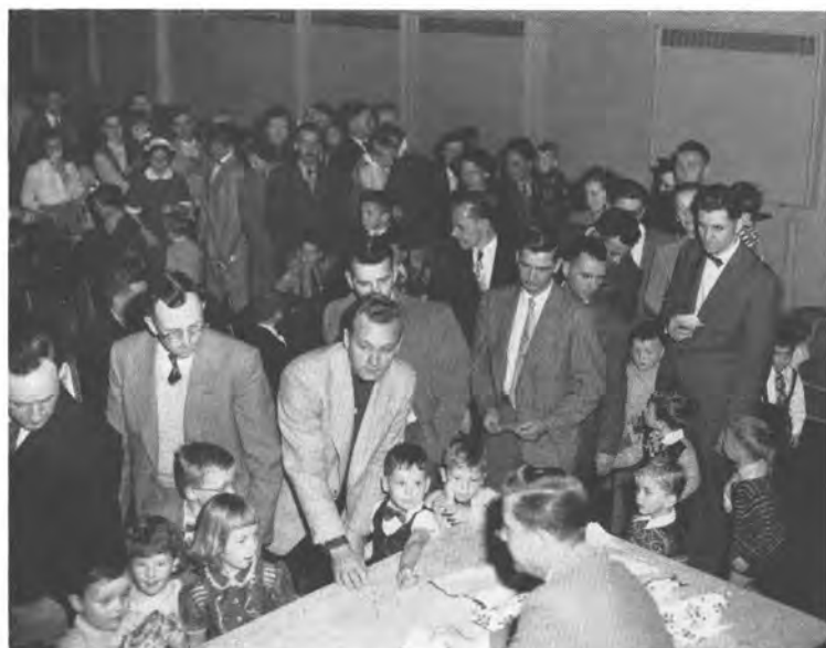
GIFTS — Gifts and fruit were distributed to the children by K.R.C. committee members at tables on both sides of Santa Claus. Here is a section of the crowd at one side of the auditorium