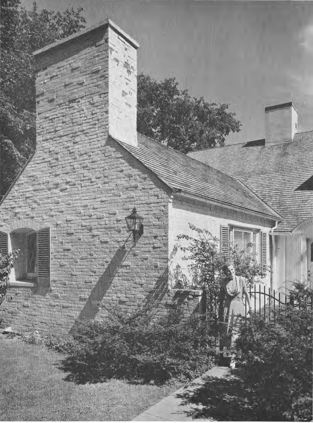
Made with the Kodak Wide Field Ektar Lens, f/6.3 .