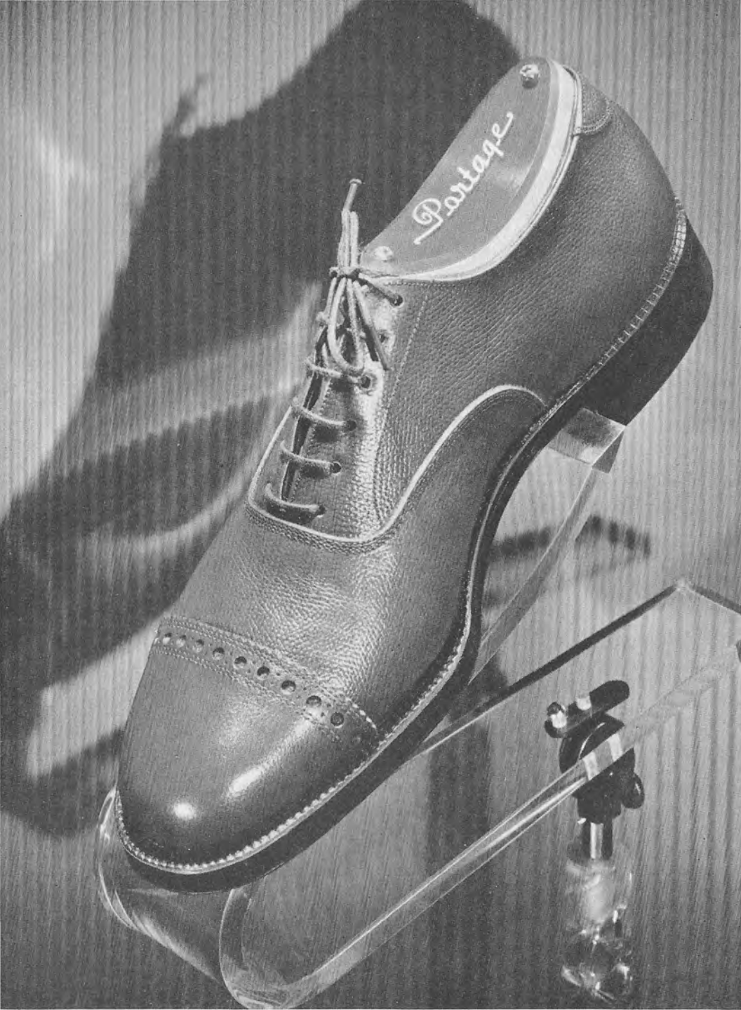
Made with the Kodak Commercial Ektar Lens, f/6.3 .