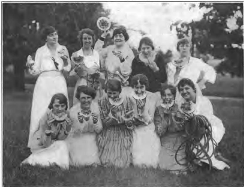
WINNERS OF THE TUG OF WAR AT THE GLEE CLUB PICNIC