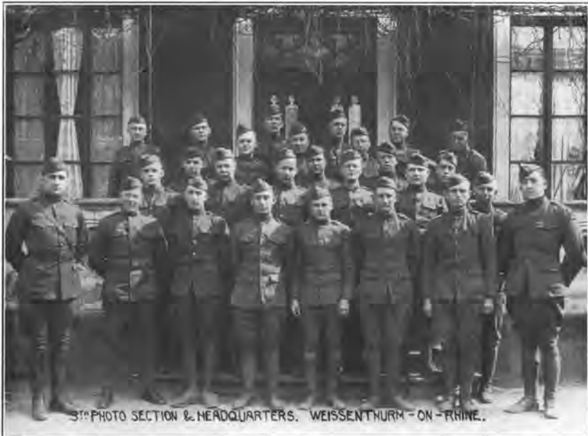
A Group of Graduates of the U. S. A. S. A. P. at Kodak Park who Rendered Valuable Service in France.