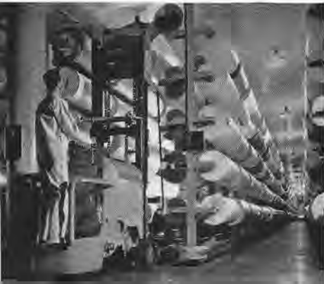
Baryta-coated paper is stored awaiting sensitizing. Handling of the 275-pound rolls is accomplished by specially designed electric trucks, to reduce hazard to personnel.

Kodabromide Paper is a fast enlarging paper of exceptional quality. It possesses remarkable exposure and development lati-