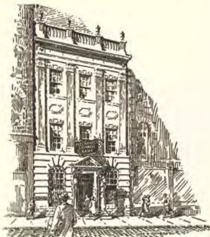
Our New Building

129th SEMI-ANNUAL STATEMENT January 1, 1932