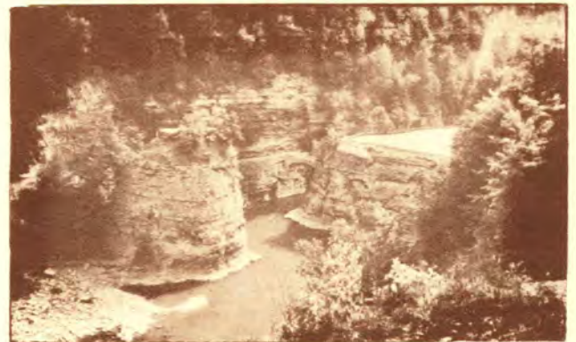
"CATHEDRAL ROCK" AND "FLUME"—LOWER FALLS

Within its boundaries are good restaurants, Glen Iris Inn, a Motel, camping cabins, a swimming pool, inviting roads and trails leading to scenic beauties, a forest arboretum, and a museum with records of the Indian and pioneer history of the region. A visit to this park is a never-to-be-forgotten experience for young and old alike.