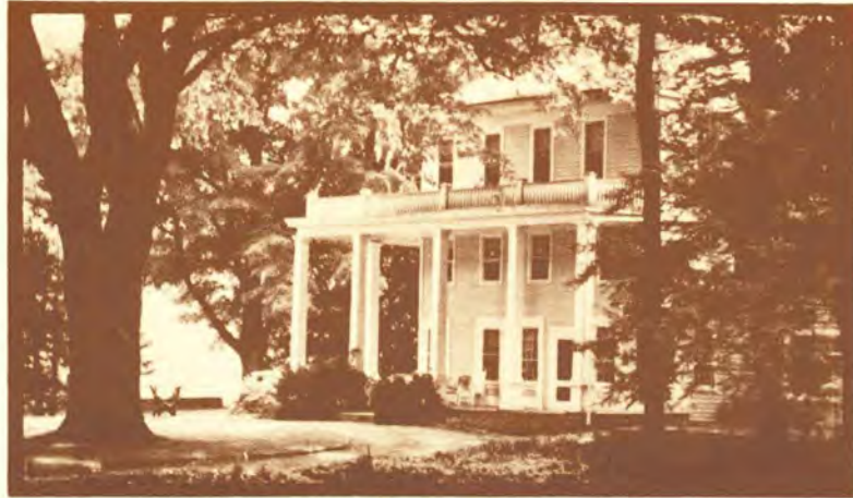
THE GLEN IRIS INN