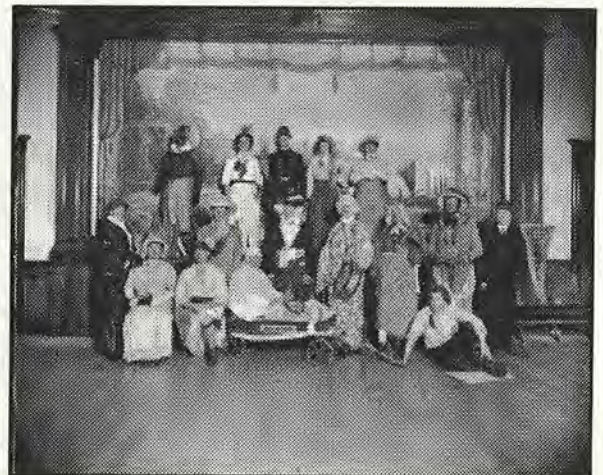
Stage Show in the Auditorium