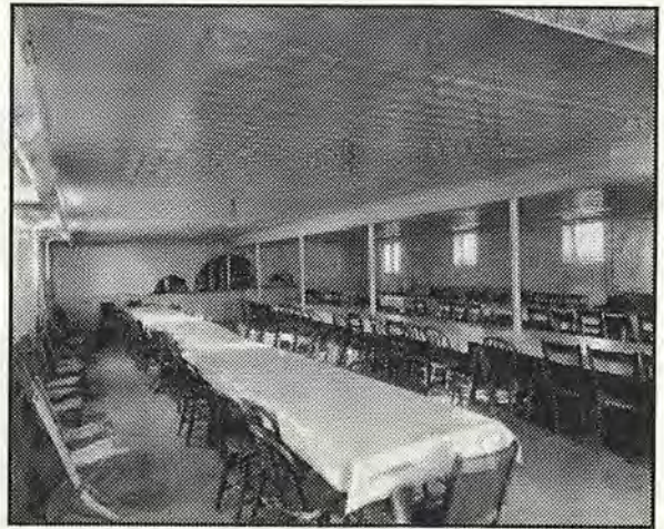
Dining Room and Kitchen