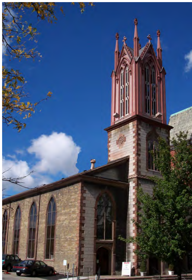
St. Luke's Episcopal Church

St. Mark's Mission Episcopal Church – baptisms 1885 – 1934, confirmations 1885 – 1933, marriages 1895 – 1934, and burials 1884 – 1933 ( FS digital film 1420004 , items 4 – 6).