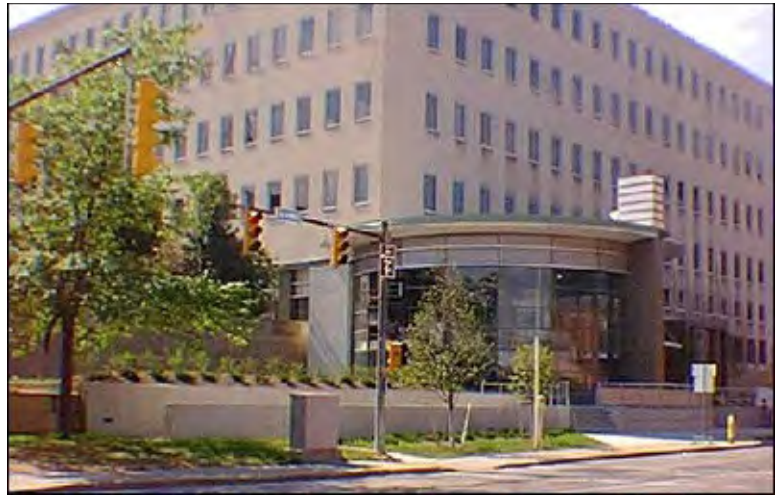
Entrance to Monroe County Civic Center

The court that settles an estate after a person has died is called Surrogate Court in New York State. This court is called Probate Court in most other states. In Monroe County, the Surrogate Court records are available from the Surrogate Court office in room 541 on the fifth floor of the Hall of Justice in the County Civic Center (99 Exchange Blvd., Rochester, NY 14614). All index volumes and file packets have been moved to a private storage company. They have been replaced with computer terminals. On the computers are indexes to all the records from 1821 to present. Also about 90% of the court files are also available to be viewed on the computers. You can email or download the entire file (as a PDF file) for a decedent to a USB flash drive. Sending the records via email may cause a problem with your email account as some of the files are very large. If there is a court file that is not yet on the computer, you can fill out a form and the office will have it scanned and make it available in a week or so.